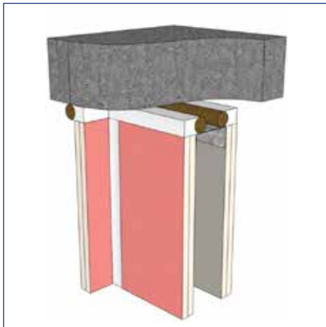
FS702 Intumastic plasterboard to concrete linear gap seal with PE backer rod: EI120